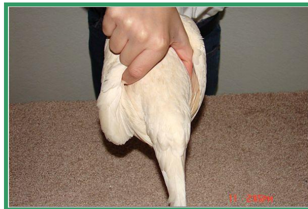
Pima County 4-H - Coussens 9/16/09

Present the bird, with outstretched arms, to the judge tail first and span the widest portion of the back over the hip bones with your fingers. Your thumb and index finger should be under the wings with your other fingers toward your body. Lift your hand off the back, keeping fingers at the width of the bird to show the judge.