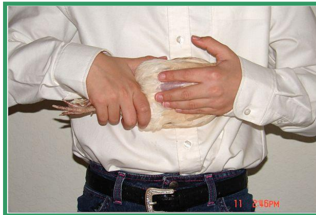
Pima County 4-H - Coussens 9/16/09

Show breastbone by turning the back of the bird against exhibitor's body parallel with the ground. With one hand grasp legs and pull to the side, having control over the lower part of birds body. Using the other hand, parallel with bird, expose breast between two fingers Ensure the breastbone is shown between fingers showing straightness.