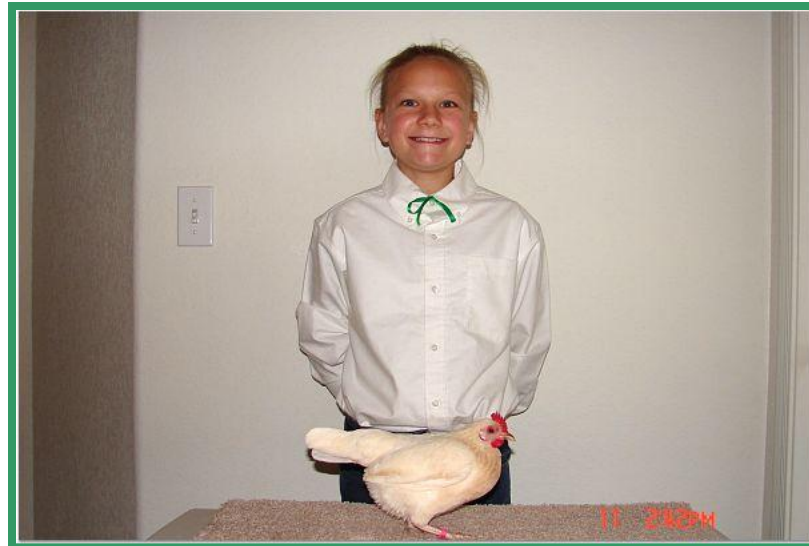
Pima County 4-H - Coussens 9/16/09

Pose the bird standing upright on the table. It is up to the judge which way to face the bird. Once the bird is posed and set, step back from the table with your hands behind your back while the judge inspects the bird.