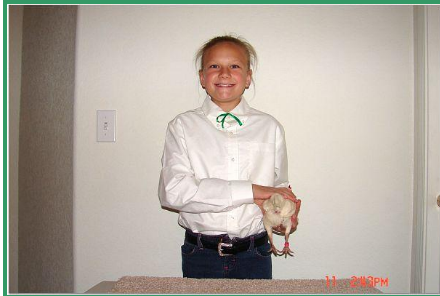
Pima County 4-H - Coussens 9/16/09

The proper way to carry a bird is to use the same hand hold as in removing from the coop with the head under the elbow and the other placed on the back.